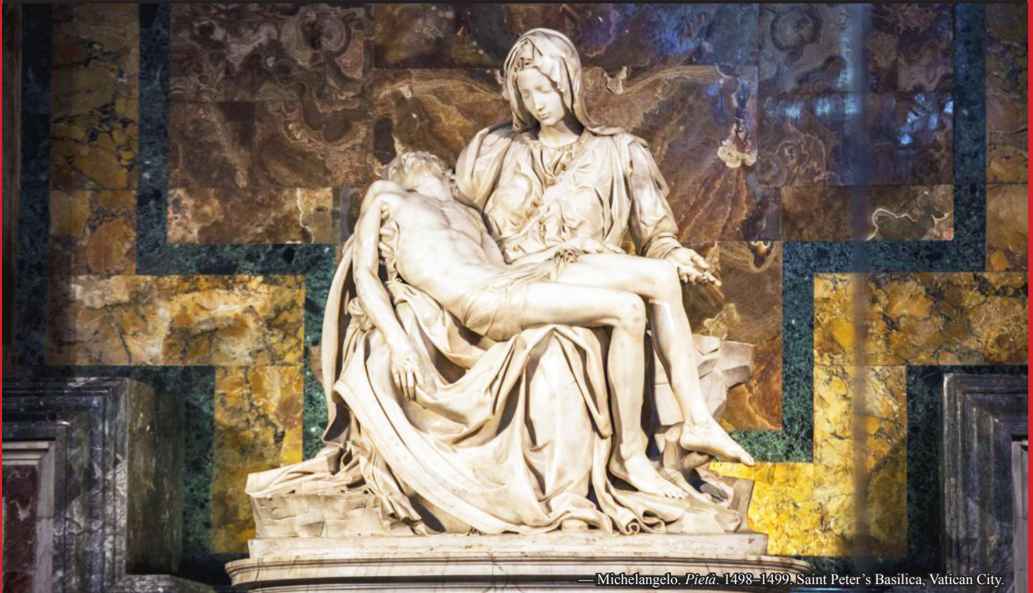
— Michelangelo. Pietà . 1498–1499. Saint Peter's Basilica, Vatican City.